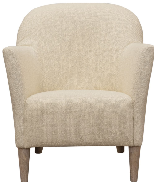
1-SEATER IN RICCARDO NEIGE