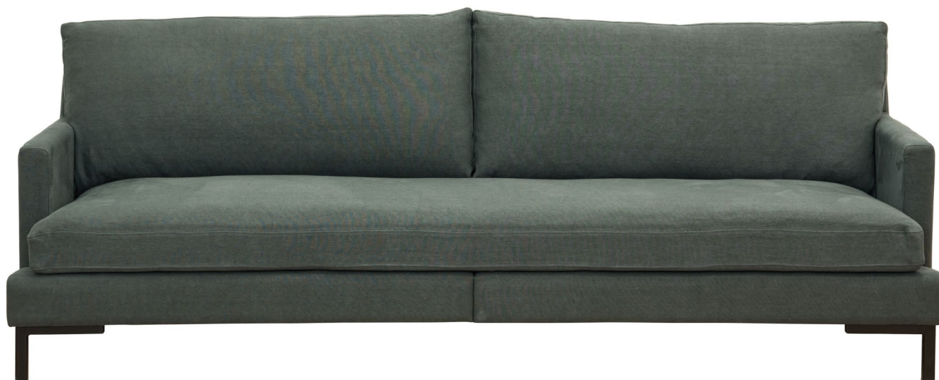
LINO 11231-28 DARK SLATE