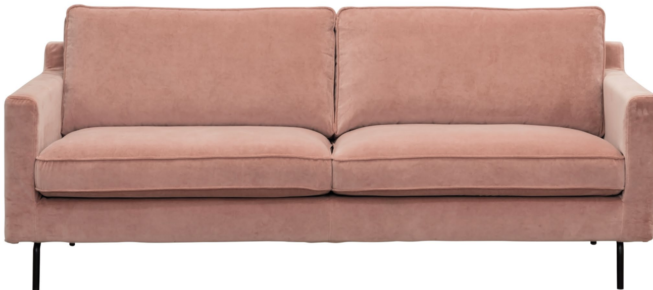
UNIQUE 11249-34 LADY