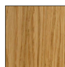
05 Oiled Oak