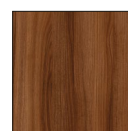
06 Oiled Walnut