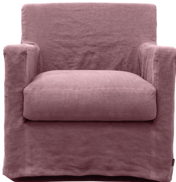
LINO 11231-54 COGNAC