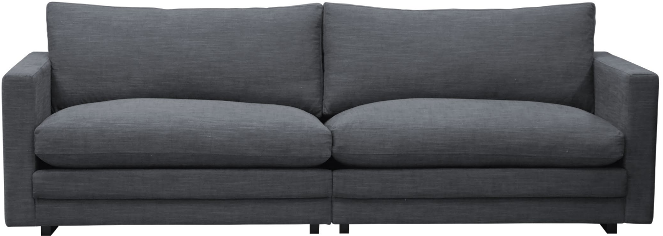
FABRIC: SOFTLEN 11016-79 METEORITE