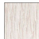
White Pigmented Oak