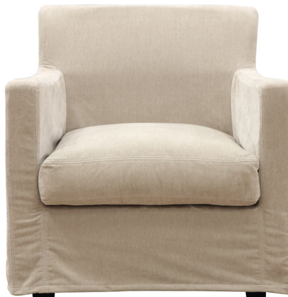
UPHOLSTERY: NORDIC 11164-61 CHINCHILLA