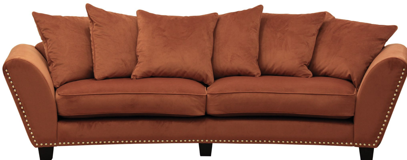
UPHOLSTERY: MEDA 11057-19 BRAN