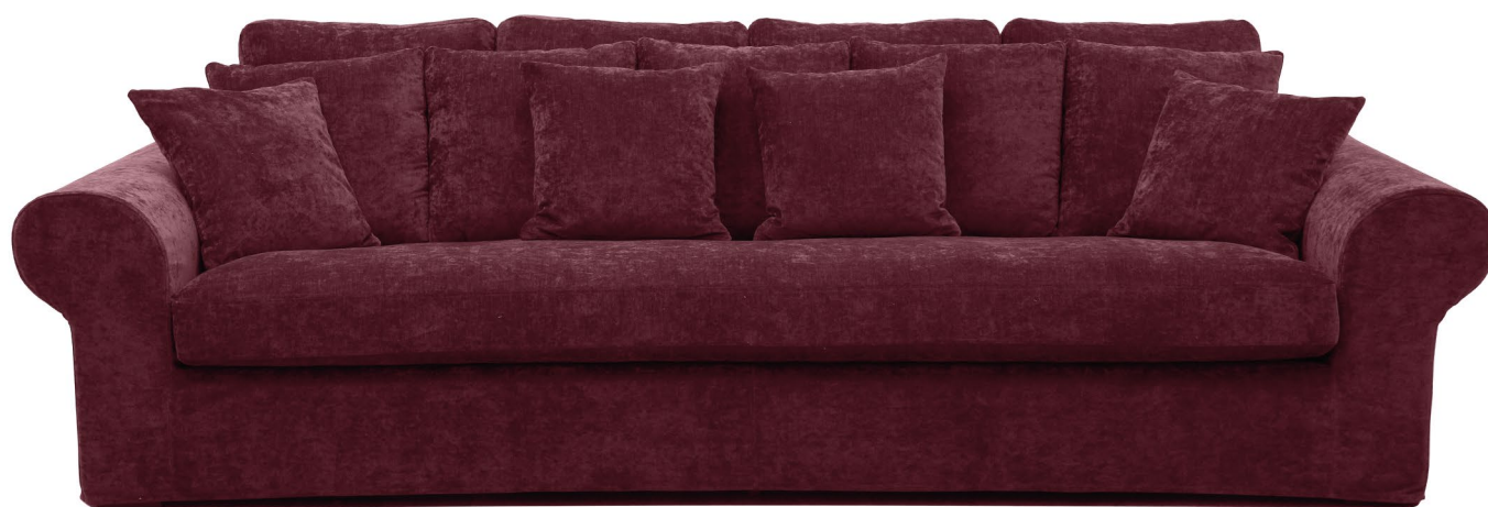
UPHOLSTERY: YOU 11211-39 RHODODENDRON