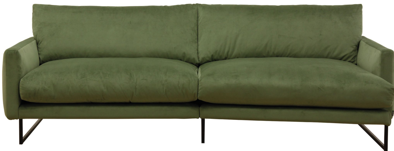
UPHOLSTERY: MEDA 11057-24 LODEN GREEN