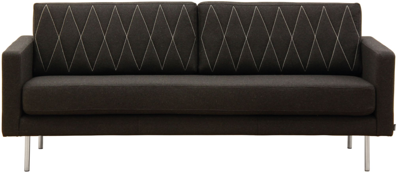
UPHOLSTERY: FACET ZWART 1003FR