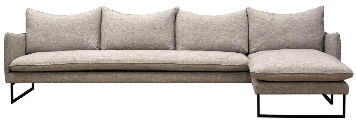
UPHOLSTERY: ARTISAN 11158-09 PUMICE STONE